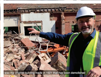
was the original building made in 1921 that has been demolished